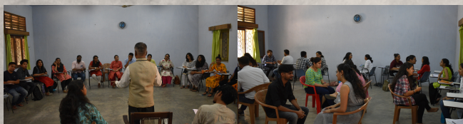
Psychology Students of Pune University